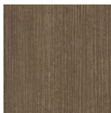
Dusty Suede 04005 V2 - Slight Variation