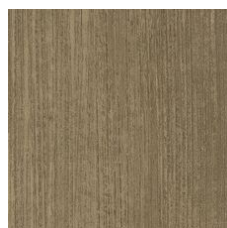
Ripe Olive 04004 V2 - Slight Variation